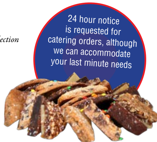
Combo Sweet Tray

24 hour notice is requested for catering orders, although we can accommodate your last minute needs