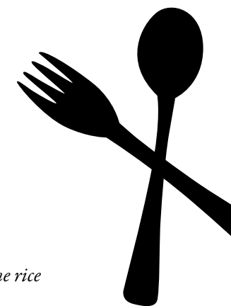
Wok Fried Rice

Seasoned chicken & beef, lettuce, pico de gallo, salsa, Monterey Jack, Cheddar cheese, corn tortillas, rice, refried beans